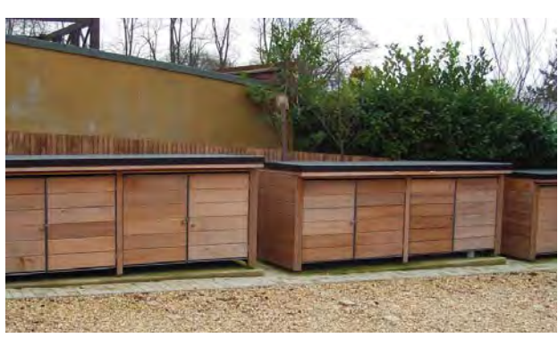
Here the storage of waste has been considered. The enclosures are designed to match the architectural language of the buildings.