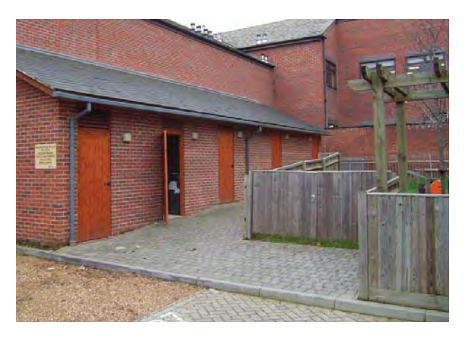
A series of enclosed waste stores for a multiple flat development have been built against an otherwise blank wall. The enclosing structure picks up reference particularly in terms of materials from the main development.