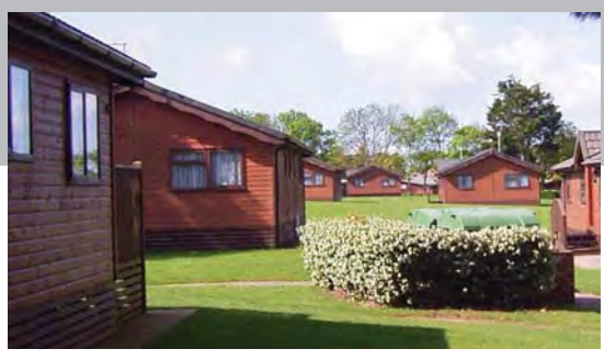
... the same arrangement but here shrub planting successfully screens.