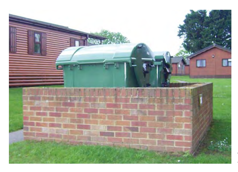
A contained, allocated space. However ...

Communal external bin stores for 1100 litre bins must allow at least 150mm clearance around each bin, with a minimum of 1m clearance if the bins are located facing each other. Screening must be provided to a height of at least 450mm above the top of the bins, and can take the form of landscape features including fencing. All communal waste storage areas should be sited to avoid any nuisance arising from odours, noise etc. and should have appropriate drainage to assist cleaning.