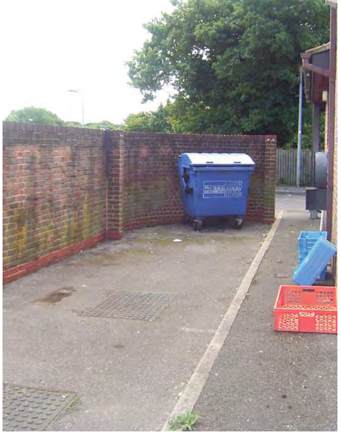
Good example of rear serviced shops with allocated/designed space.