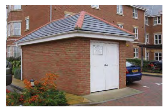
Here a waste storage building has been designed as an integral part of the development.

Communal external bin stores for 1100 litre bins must allow at least 150mm clearance around each bin, with a minimum of 1m clearance if the bins are located facing each other, or if provision is made for individual waste storage for each dwelling, sufficient space to accommodate at least two refuse sacks per dwelling. Communal external stores should provide facilities for the convenient disposal of household refuse and recyclables, but should not provide locations for the disposal of bulky household waste, such as furniture and white goods. The stores should be sited unobtrusively, preferably within one or more purposedesigned, roofed enclosures that are easily accessible to all users, and integrated in terms of design with the rest of the development and the landscaping scheme. Screening must be provided to a height of at least 450mm above the top of the bins or other form of waste storage, and can take the form of landscape features including fencing. All communal waste storage areas, including screened hardstandings and enclosed stores, should be sited to avoid any nuisance arising from odours, noise etc., should have basic lighting (e.g. solar lights) and should have drainage facilities to assist cleaning. Security should be provided for all communal waste storage areas, to design out opportunities for anti-social behaviour or fly tipping.