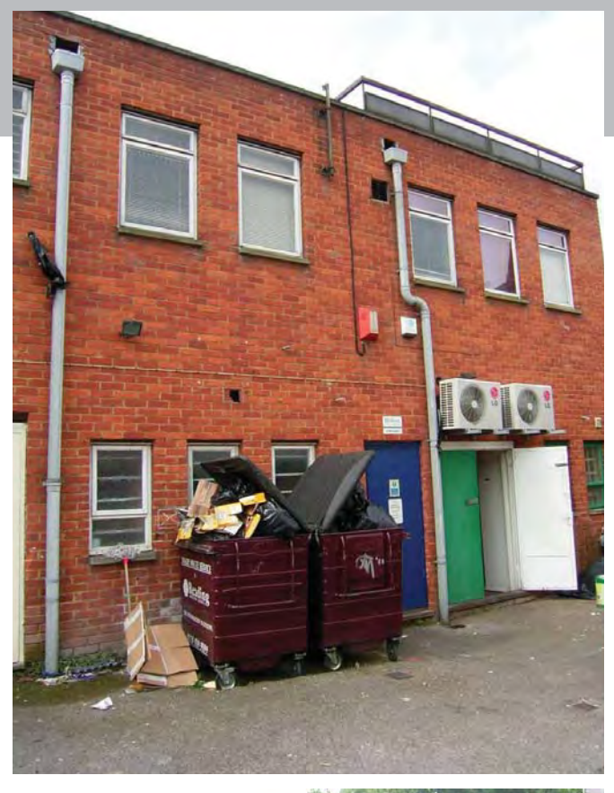
This illustrates the inevitable problems of unsightly accumulation of waste where no area is specifically allocated to bins.