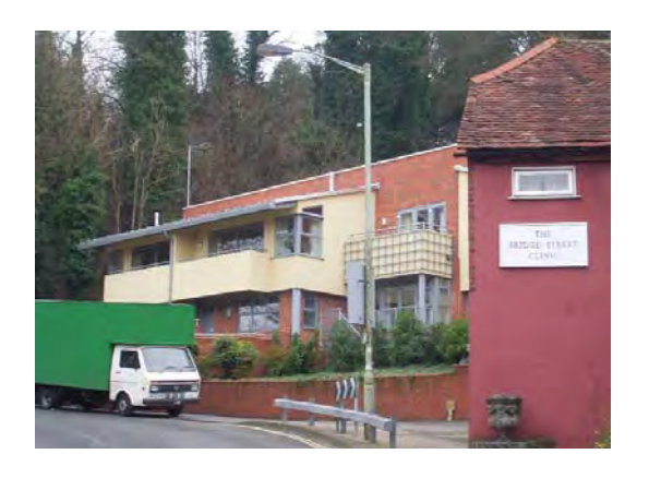
Modern infill on an awkward urban site still manages to physically define a space for waste storage.