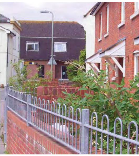
On the same development whilst the design intention is good the execution doesn't meet expectation. Doors on the front of the enclosures might have produced a better end result.