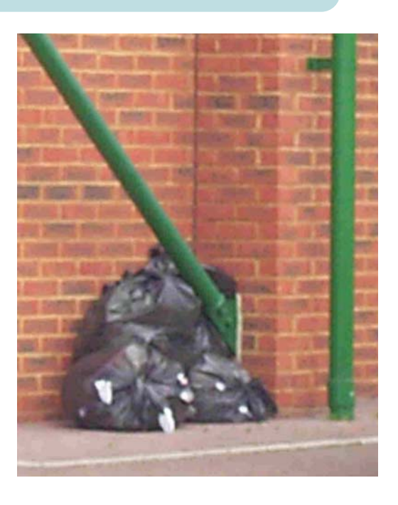
Bags left in an allocated space but no enclosure results in an unsightly appearance and can encourage fly-tipping and vandalism.