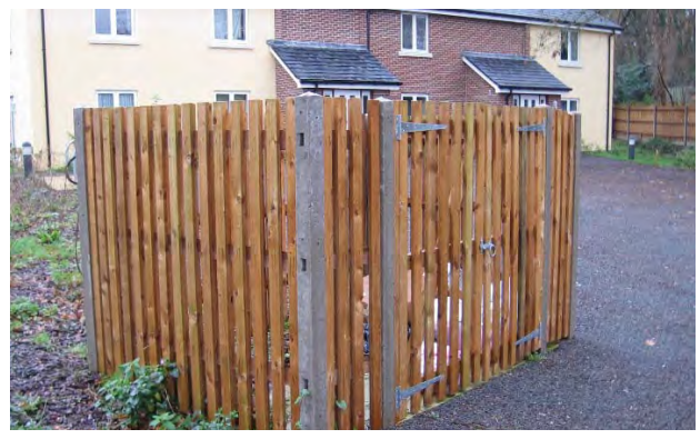
A communal store screened from the surrounding open space.