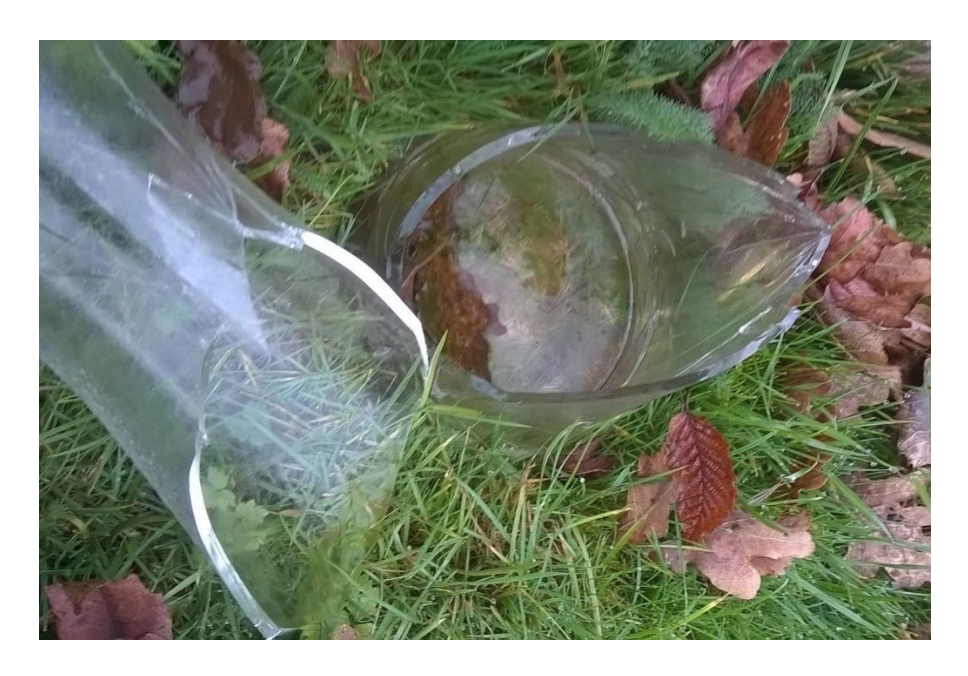
An example of unauthorised, hazardous memorabilia

Glass vases, astro turf, wind chimes, naked flames, balloons, solar lights, lanterns, and wire fencing.