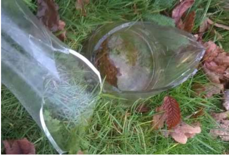
An example of unauthorised, hazardous memorabilia