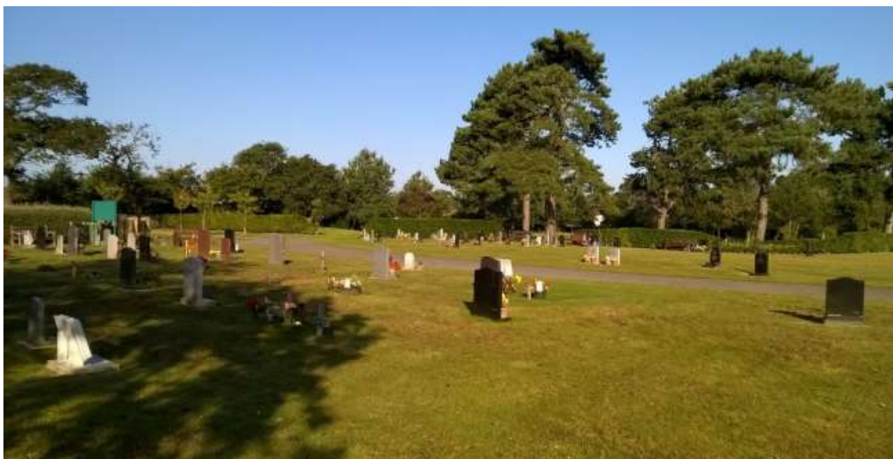
Milford Road Cemetery. An example of an NFDC Cemeteries Lawn Section.