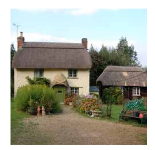
Cottage and outbuilding with simple block cut ridge