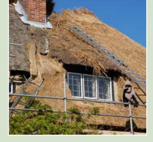
Detail of reed thatch