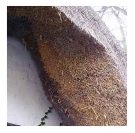
Layers of thatch

A thatched roof may be of particular interest because the layers of thatch may have remained undisturbed for many centuries due to it never having been completely stripped back to the timber work. As mentioned earlier this is sometimes evident in smoke blackening dating from a time prior to the insertion of chimneys. It is an aim of conservation policy to protect this historic or archaeological material.