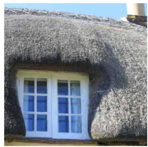
Traditional detailing around windows using liggers

The second zone is the north western part of the area comprising the Avon Valley to the south of Salisbury, the villages to the west and the forest villages above the eastern slopes of the Avon valley. In this zone the historic thatching tradition would have been one of long straw. Today, with the exception of 'estate villages' like Breamore and other pockets, the predominant thatch material is still straw but in its combed wheat form. There remains a strong long straw tradition in this zone.