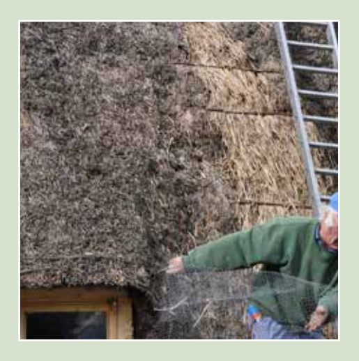
Patch repairs to a combed wheat reed roof