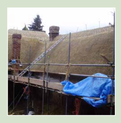
Thatching in progress