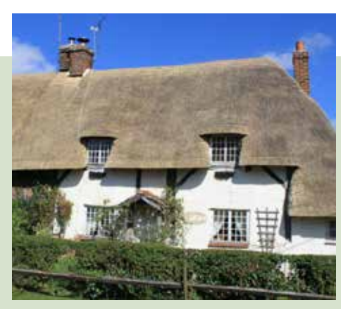
Estate cottage, Breamore

The word 'thatch' is Anglo-Saxon in origin and simply meant roof covering. In time the word came to mean a vegetable covering. It is one of the oldest construction techniques known to man, but in Britain there is little agreement on its development, and there has been little professional study of its origins..