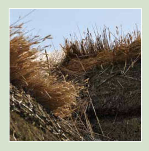
Layers of thatch - new thatch on existing