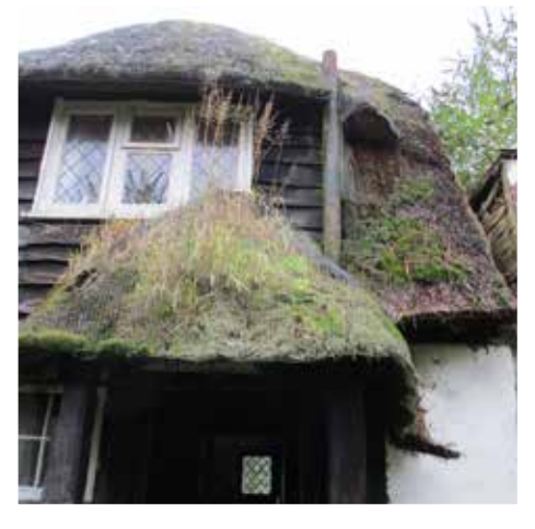
Thatch in poor condition

If an owner receives advice on changing to a different type of thatch, then it is important to remember that this may require consent from the local authority. The need for consent is considered in more detail later in this leaflet.