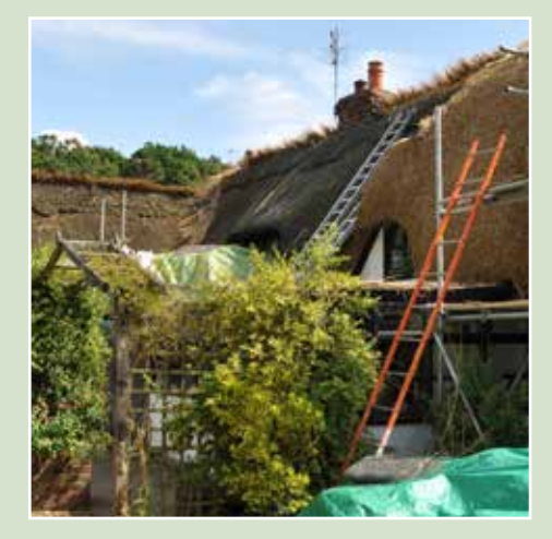
Re-thatching in progress