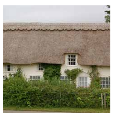
Modern block-cut ridge