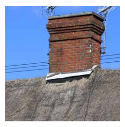
Thatch around the chimney is badly eroded