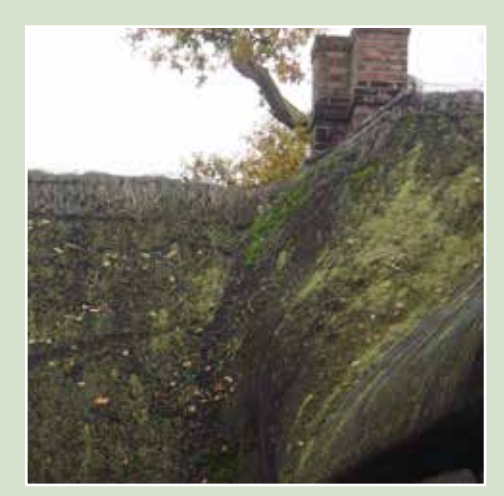
Moss build up on a deteriorating thatched roof