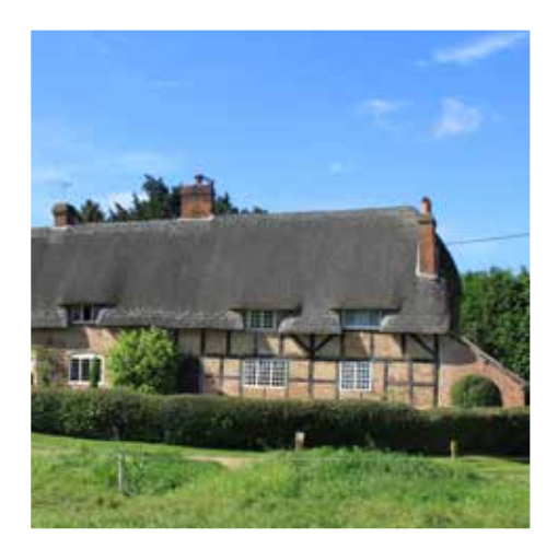
Longstraw thatch, Breamore

The second zone is the north western part of the area comprising the Avon Valley to the south of Salisbury, the villages to the west and the forest villages above the eastern slopes of the Avon valley. In this zone the historic thatching tradition would have been one of long straw. Today, with the exception of 'estate villages' like Breamore and other pockets, the predominant thatch material is still straw but in its combed wheat form. There remains a strong long straw tradition in this zone.