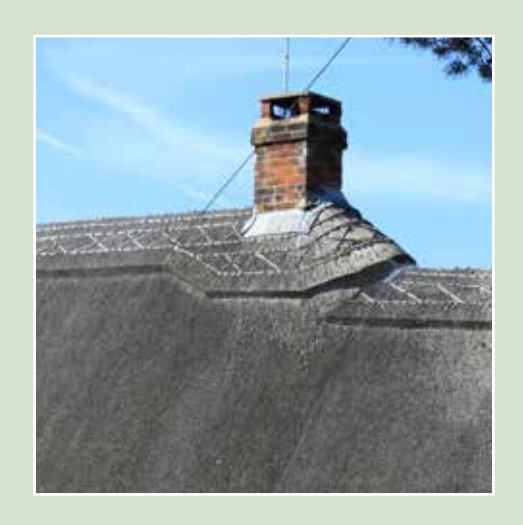
Detail of long straw