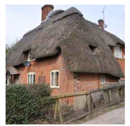
Decorative block cut ridge

The third zone is the remainder of the area, comprising much of the forest and the agricultural areas to the north east. This zone would have traditionally been an area of long straw thatch. Today much of the thatch is combed wheat reed with the occasional incidence of water reed.