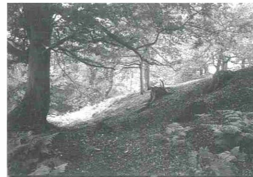
One of the banks of the hillfort