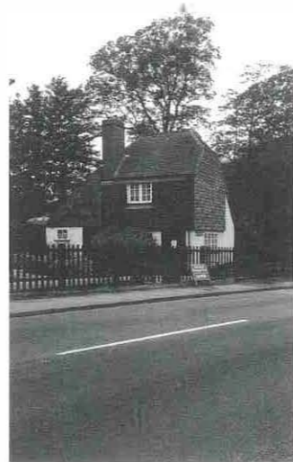
The Toll House

4 Southampton Road and Lower Buckland Road (opposite the toll house) were turnpiked following an Act of Parliament in 1765. The old toll house has a recorded history from 1795 when the toll keeper was called James Stanley. The toll house was last occupied in 1952. The Buckland Trust was set up to focus attention on the historic worth of Buckland and the Iron Age hill fort. With the help of grants the building was turned into a museum with exhibitions explaining the history and archaeology of the area.