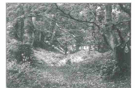
One of the ditches of the hillfort