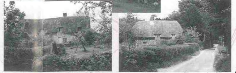
Cross Trees Cottages