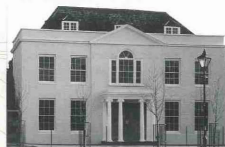
18-20 Market Place