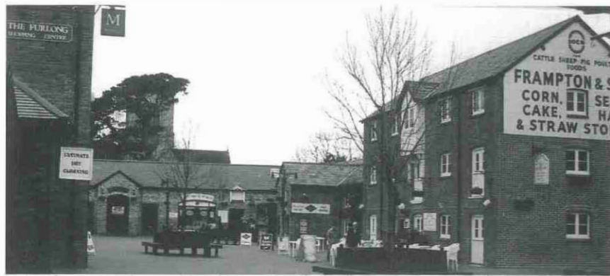
The Furlong Centre