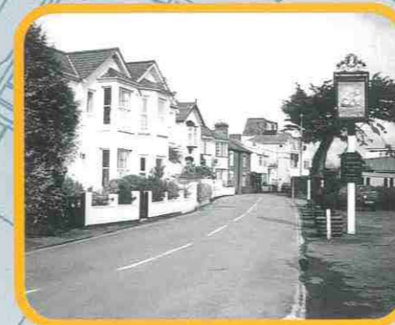
The front of the Mayflower onto King's Saltern Road

These are some of the things that make King's Saltern special - they need to be looked after: