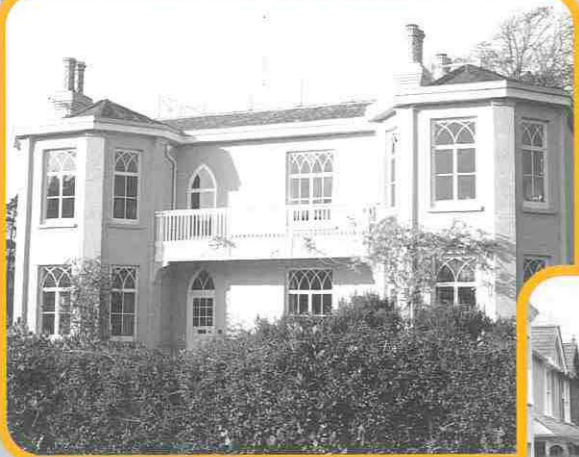
Harpers Marsh and Harpers Reach