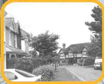
Views from Stanley Road to the Mayflower