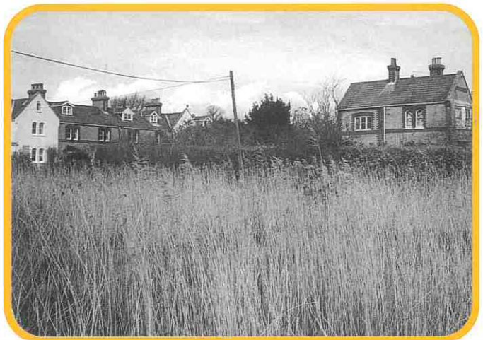
• The coastguard buildings viewed from across the adjacent marshy land

King's Saltern Road still has an attractive semi-rural feel, flanked by trees and hedges and old cottages and without pavements