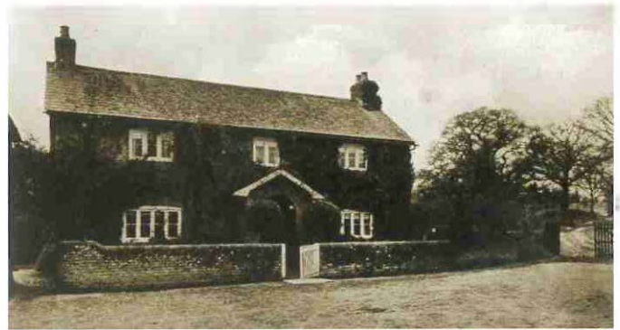
Early photograph of Hazel Farm, circa 1930

Both these farms are important historic sites that are gradually being surrounded by new housing as the edge of western Totton advances across their former farmland towards the bypass. Hanger Farm, designated in 1986 as new housing close by was being built, contains two important listed buildings. The farmhouse is an intriguing, valuable house of the seventeenth century, and the 9-bay barn is equally impressive. Hazel Farm dates from the nineteenth century with a substantial brick farmhouse and a yard with brick and timber-framed barns and cowsheds. It sits in a shallow valley with many mature trees around a sunken lane. Both areas were designated, knowing that the historic buildings would, as development gradually closes around them, be seen as familiar and highly valued reference points for the community.