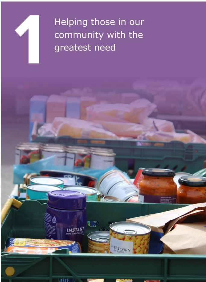
A food larder at one of our community hubs

Helping those in our community with the greatest need