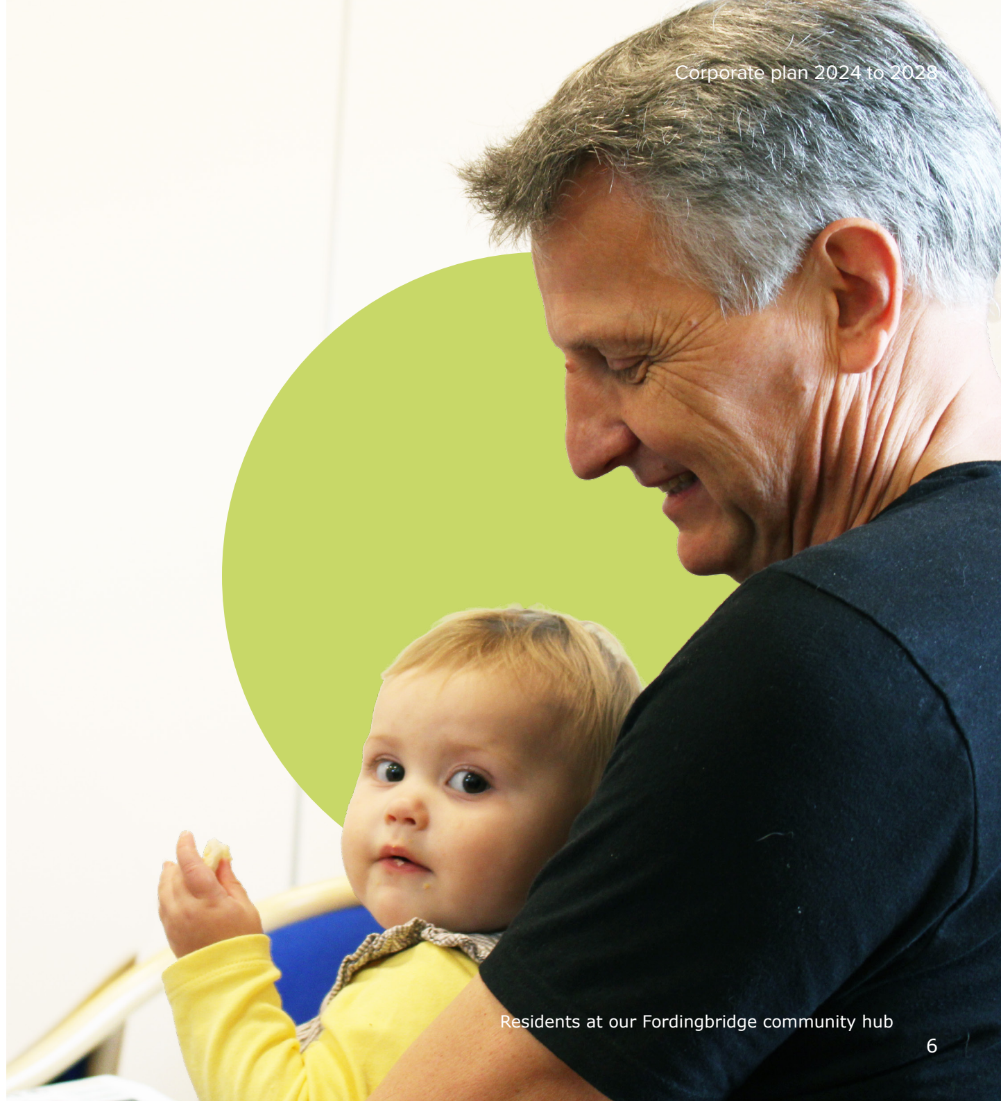
Residents at our Fordingbridge community hub

To secure a better future by supporting opportunities for the people and communities we serve, protecting our unique and special place, and securing a vibrant and prosperous New Forest.