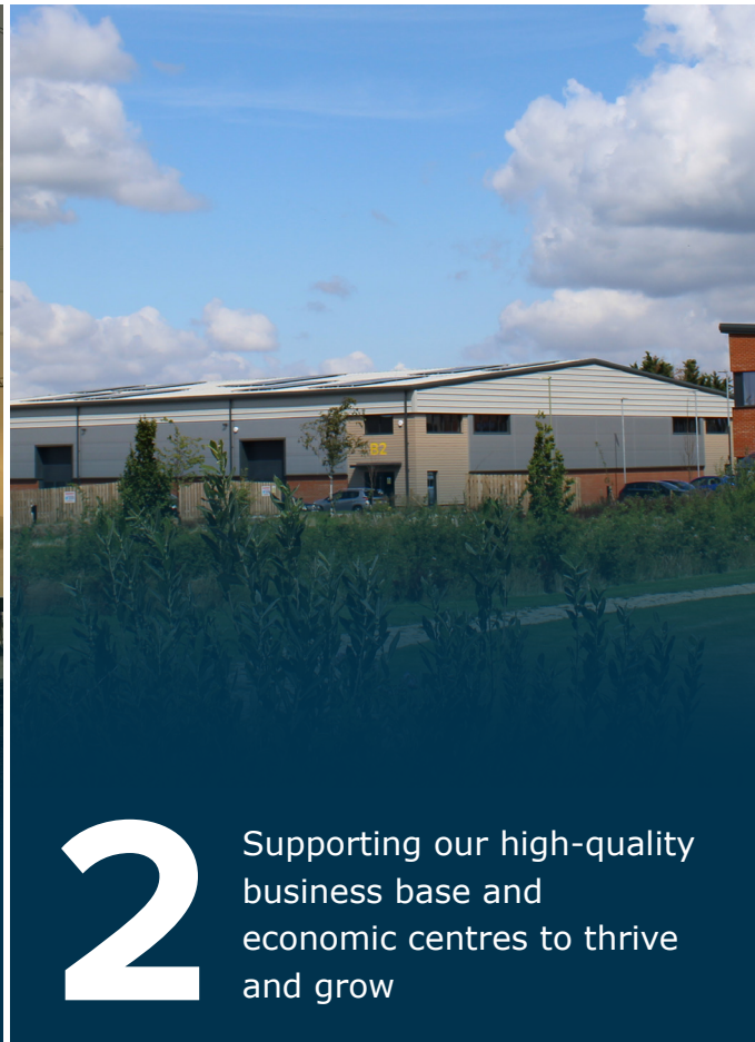
Platinum Jubilee Business Park, Ringwood