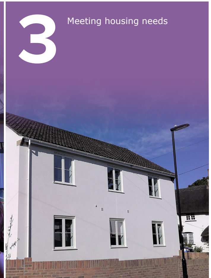
One of our housing developments, Platinum House, Ringwood