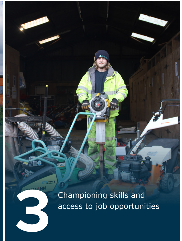
One of our grounds maintenance apprentices