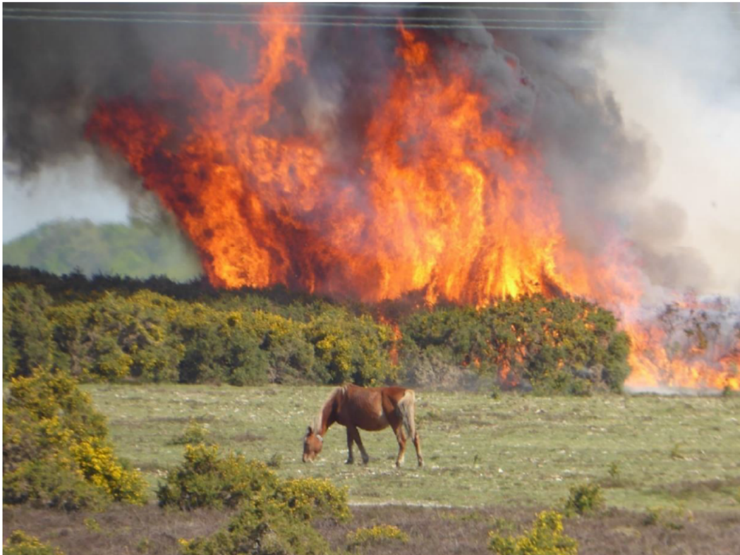
Photograph of Forest fire: April 2020