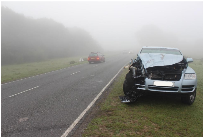
Photograph of RTA with grazing livestock: Sept 2013

2.3 The risk is not just to the ponies and the fabric of the Forest, it is a serious risk for car drivers if their vehicle is involved in a road traffic accident (RTA) involving ponies and other grazing animals.