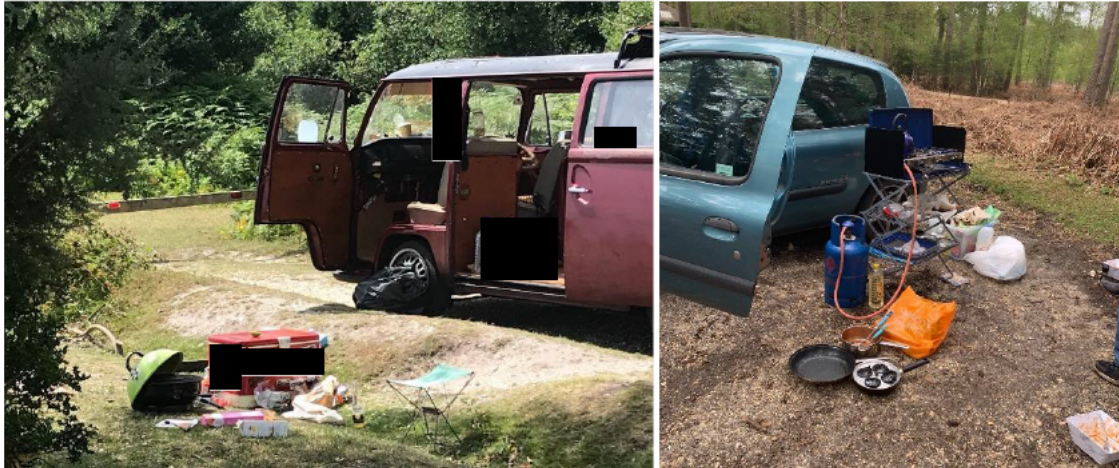
An increasingly common sight in the New Forest