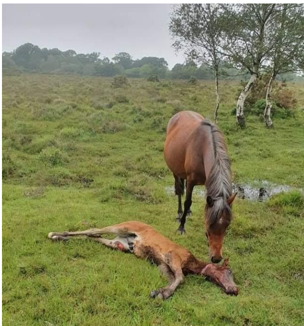
Various media posts from 2021 and a New Forest pony mourning the loss of a foal in a 'hit and run' incident