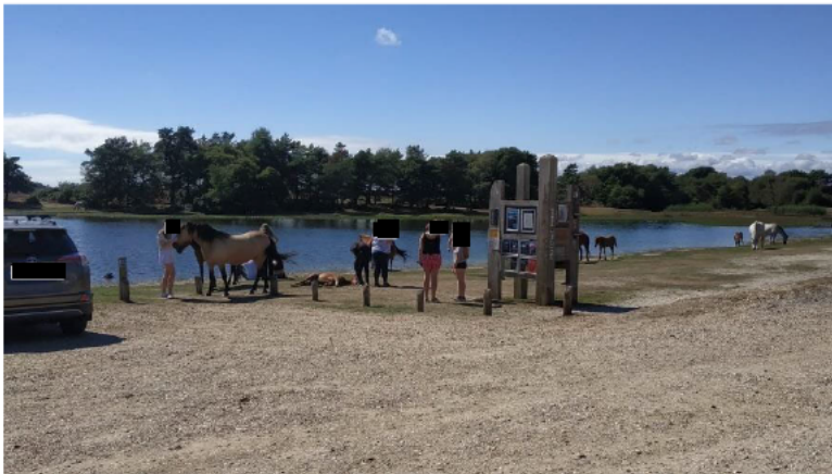
Pony petting at Hatchet Pond on 24 August 2022

2.4 Furthermore, this constant feeding and petting of ponies is already leading ponies to adopt some 'learned behaviours' by closely associating visitors with food. It is increasingly common to see ponies congregating around parked cars, harassing and 'begging' the car's occupants for food. Not only is this bad for the ponies and the future of commoning in the New Forest, it spoils people's enjoyment of the area and in a few cases, people can feel quite intimidated. A snapshot of the 119 'feeding and petting' incidents recorded by the NPA Ranger Team over a six month period in 2021 is attached as Annex 1.