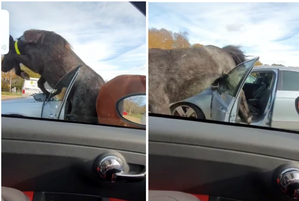
A pony becomes aggressive having got trapped between two cars after taking food from the driver of the grey coloured car - Cadnam Cricket pitch