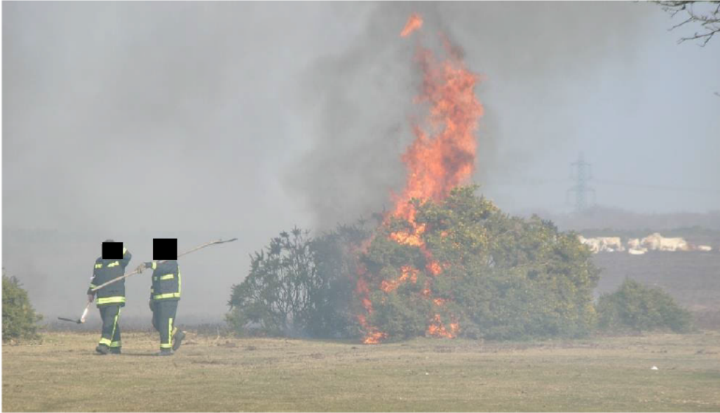
Photograph of Forest fire: August 2022