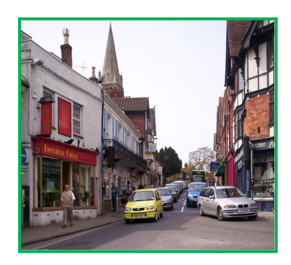
With the filter lane in use